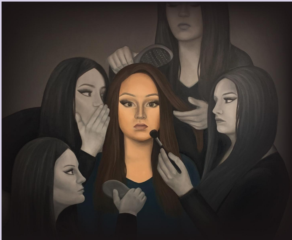
Alyssa Cusimano, Scopophobia , 36 in x 48 in, 2023, oil on canvas