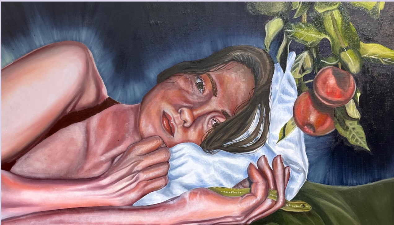
Dana Garrison, Blame Me , 2023, 23.5 in x 40 in, Oil paint on Canvas