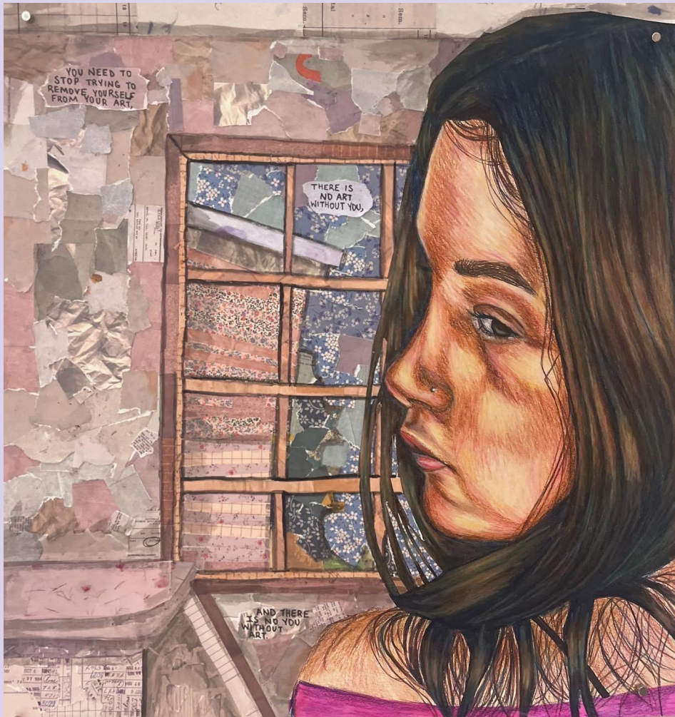
Dana Garrison, Letter #5 , 2022, 19 in x 19 in, Mixed Media