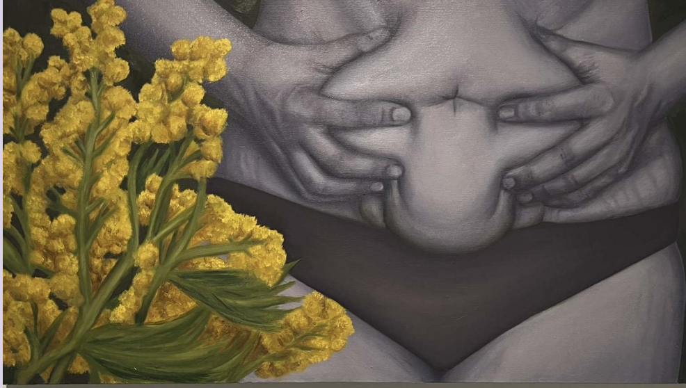
Alysa Cusimano, Occhiolism , 24 in x 42 in, 2022, oil on canvas