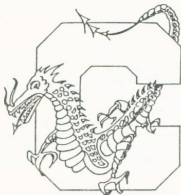
CORTLAND RED DRAGONS