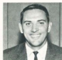
AL STOCKHOLM Basketball