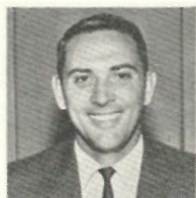
AL STOCKHOLM Basketball