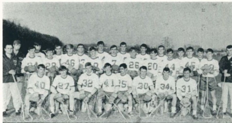
1968 — LACROSSE TEAM