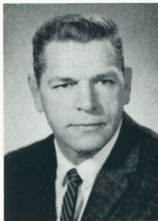
is head Red Dragon basketball mentor as well.